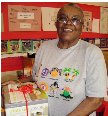
Top: attendees of the Caribbean Health Day