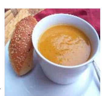
Spicy Pumpkin Soup